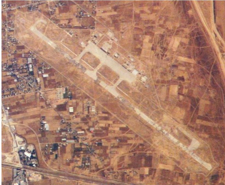
Satellite photo of the destroyed runway